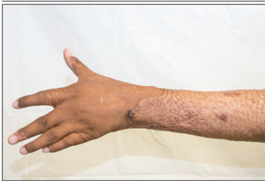
Figure 4. Sheet Skin Grafts and Meshed Grafts on a Patient's Hand and Arm.

Sheet skin grafts, shown on the patient's hand, are not meshed and have a much more natural appearance than meshed grafts, shown on the arm.